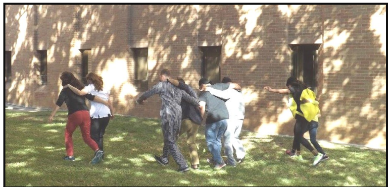
GAME WINNERS: 1ST, WHITLEY PENN; 2ND, PSK; 3RD, BAP