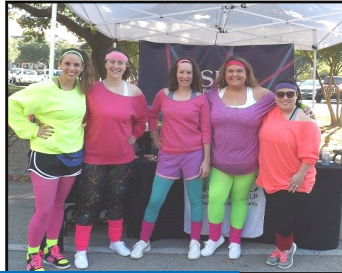
Salmon Sims Thomas (far left), Sutton, Frost, Cary (left), Grant Thornton (bottom left) & Clifton Lawson Allen (bottom right) had creatively themed booths.