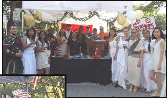
Accounting Society super heroes (above) & BAP ancient Romans (top right); Dept. of Acct. "Electioneers" (right) served "Swamp Chili".