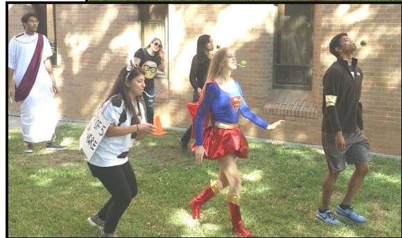
Sack Races, Spoon Relays & 3-Legged Races brought zombies, CFA Cows, Ghostbusters, Harry Potter characters, Ghouls, & 80's gals together for friendly competition.